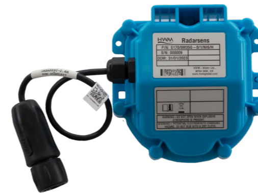
RadarSens Radar Level Sensor

RadarSens is our cost-effective and easy-to-install level monitoring system that uses radar sensing technology to effectively monitor level in waste water networks. Intrinsically safe and compatible with our range of HWM data loggers, RadarSens includes a variety of different deployment features to ensure a quick and 'right first time' deployment.