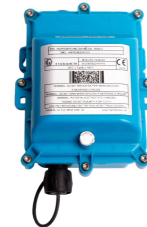
IS Log ATEX Certified Data Logger