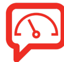
AUTOMATED METER READING