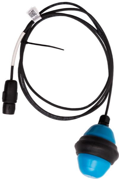
SpillSens Digital Float Sensor

SpillGuard can display general site statistics and trends , as well as specific site details. Individual users and reports are managed using an advanced platform which includes the option to forward alarm messages via e-mail or SMS.