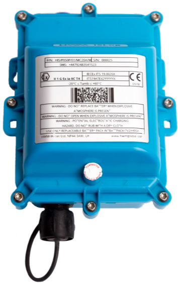
IS Log ATEX Certified Data Logger